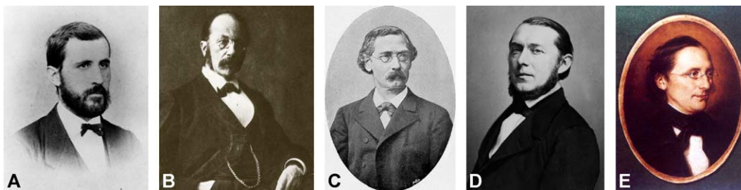
Fig. 1. Friedrich Miescher and his mentors. (A) Friedrich Miescher (1844–1895) as a young man. (B) Wilhelm His (1831–1904), Miescher’s uncle. His still is famous for his work on the fate of cells and tissues during embryonic development and for his insights into neuroembryology. He, for example, discovered neuroblasts and coined the term “dendrite” (Finger, 1994; Shepherd, 1991). (C) Felix Hoppe-Seyler (1825–1895), one of the pioneers of physiological chemistry (now biochemistry). Hoppe-Seyler performed seminal work on the properties of proteins, most notably hemoglobin (which he named), introduced the term “proteid” (which later became “protein”), and worked extensively on fermentation and oxidation processes as well as lipid metabolism (Perutz, 1995). He was instrumental in founding Germany’s first independent institute for physiological chemistry (in 1884) and in 1877 founded and edited the first journal of biochemistry, the Zeitschrift für Physiologische Chemie , which still exists today as Biological Chemistry . (D) Adolf Strecker (1822–1871), a leading figure in chemistry in the mid-19th century and professor at the University of Tübingen from 1860 to 1870. Among other achievements, he was the first to synthesize an amino acid (alanine from acetaldehyde via its condensation product with ammonia and hydrogen cyanide) in a reaction known today as Strecker synthesis (Strecker, 1850). (E) Carl Ludwig (1816–1895), a protagonist in the field of physiology in the second half of the 19th century. His focus was the physiology of the nervous system and its sensory organs. In 1869, he founded Leipzig’s Physiological Institute.

At 17, he began his medical studies in Basel—interrupted only by a semester in Göttingen, Germany—and concluded them in the spring of 1868 at the age of 23. To accommodate his father’s wish for “practical competence,” Miescher specialized as an otologist after finishing his basic medical training. However, Miescher only had a very limited interest in the practice of medicine—not least as it