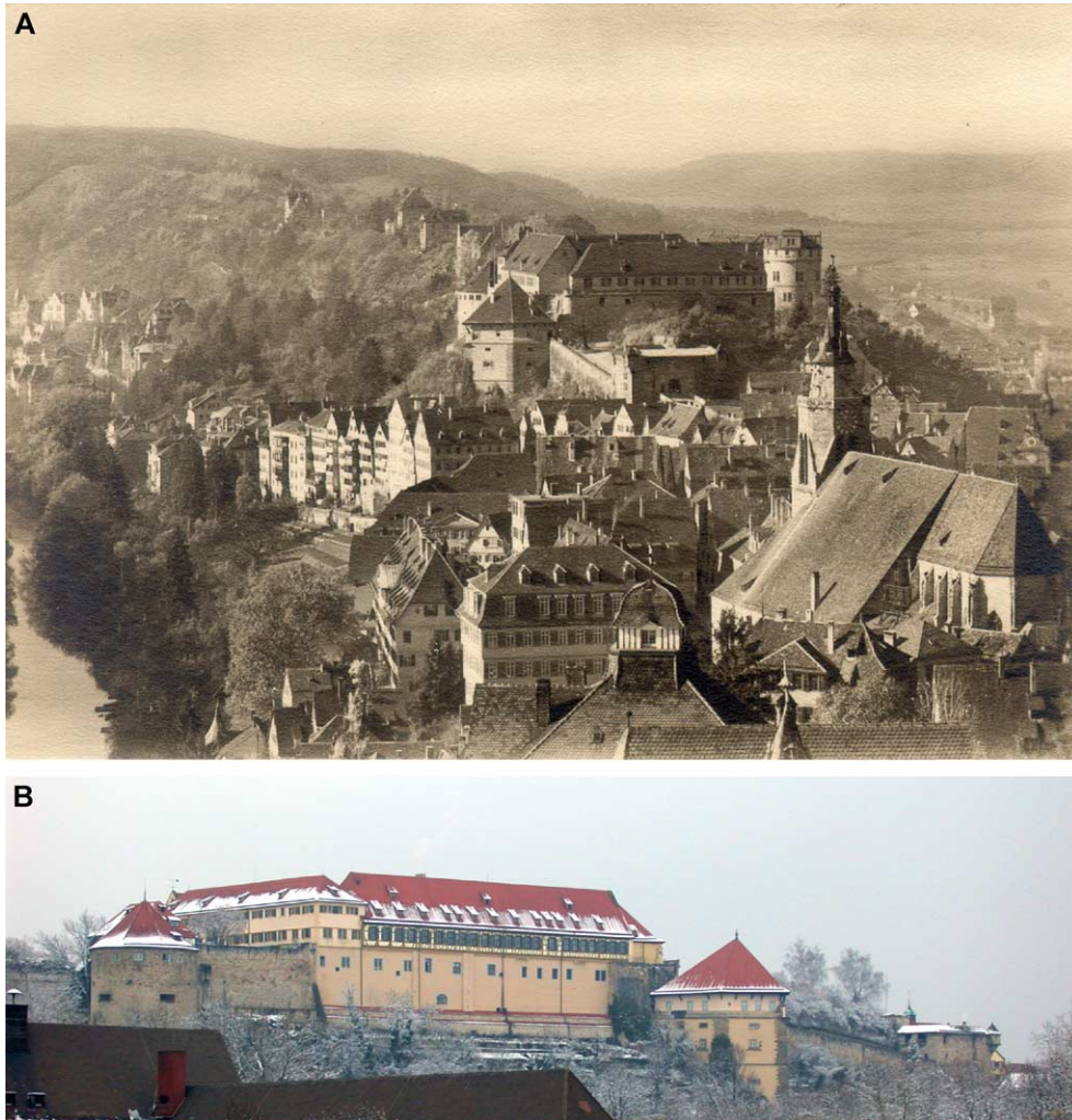
Fig. 3. Tübingen castle. (A) Historic photograph of Tübingen castle (seen from the east) overlooking the old town. The picture was taken around the time of Friedrich Miescher's stay in Tübingen. (B) Tübingen castle today (seen from the south). The picture was taken at roughly the same time of year as when Miescher first isolated DNA. The laboratories of Friedrich Miescher and Felix Hoppe-Seyler were located next to each other on the ground floor of the main building (lower row of windows in the façade of the main building facing the viewer).

Realizing a potential significance, he wrote, “A material made up of only cells, such as this one, would above all finally call for a serious study of the chemical constitution of the cell's nucleus” (Miescher, 1871d). However, Miescher still needed to separate the novel substance from the proteins in his cell extracts in order to better analyze it. He thus had to develop new protocols to first separate the cells' nuclei from the cytoplasm and then isolate the enigmatic precipitate (see Box 1 ).