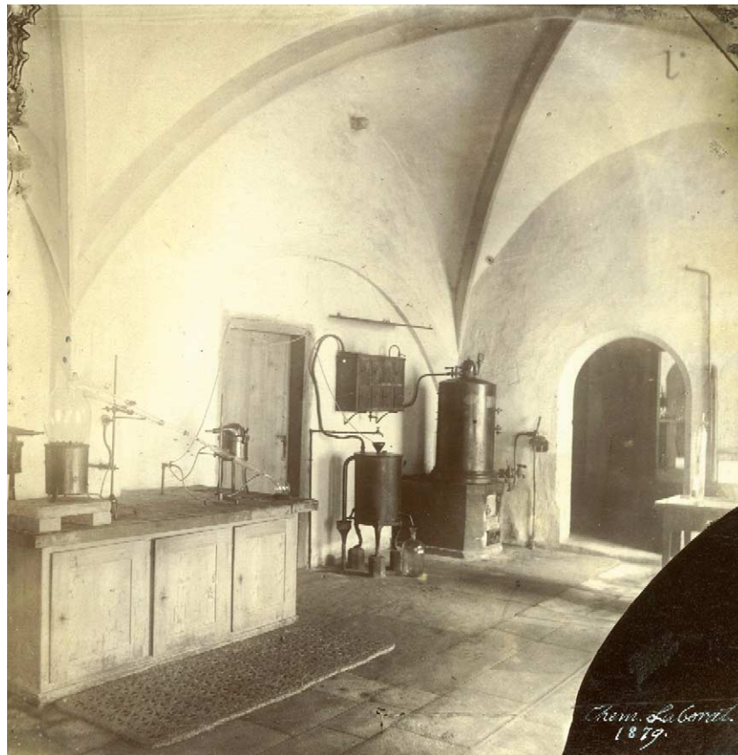
Fig. 4. The laboratory in the former kitchen of the castle in Tübingen as it was in 1879. It was in this room that Miescher had discovered DNA 10 years earlier. The equipment and fixtures available to Miescher at the time would have been very similar, with a large distillation apparatus in the far corner of the room to produce distilled water and several smaller utensils, such as glass alembics and a glass distillation column on the side board.

In Basel, Miescher resumed his research on nuclein, which had rested during his stay in Leipzig. However, owing to poor working conditions, his progress initially was painfully slow (Miescher, 1872b). In a letter to a friend he complained, "In