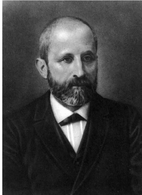
Fig. 6. This picture of Friedrich Miescher in his later years is the frontispiece on the inside cover of the two volume collection of Miescher's scientific publications, his letters, lecture manuscripts, and papers published posthumously by Wilhelm His and others (His et al., 1897a,b).