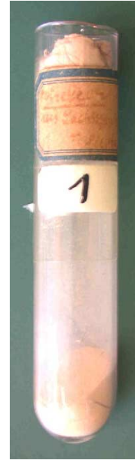
Fig. 5. Glass vial containing nuclein isolated from salmon sperm by Friedrich Miescher while working at the University of Basel. The faded label reads “Nuclein aus Lachssperma, F. Miescher” ( Nuclein from salmon sperm, F. Miescher). Possession of the Interfakultäres Institut für Biochemie (Interfaculty Institute for Biochemistry), University of Tübingen, Germany